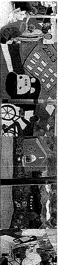
Images of Lakeland Past and Present Community Mural.

FOR MORE INFORMATION AND SIGN-UP, VISIT WWW.GOODNEIGHBORDAY.UMD.EDU .