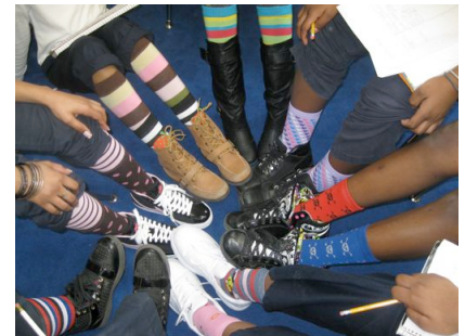
5 th Grade students "Sock It To MSA" for MSA Spirit Week 2010

We are still in need of tissue and hand sanitizer. Thanks!!